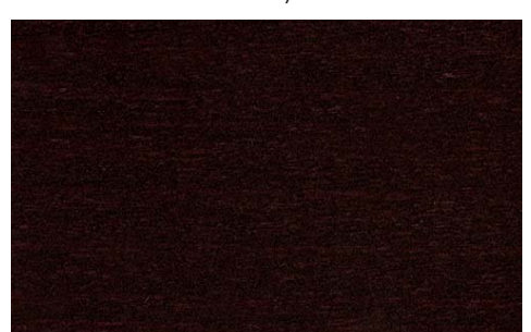
A 1.144 beech wenge dark stain