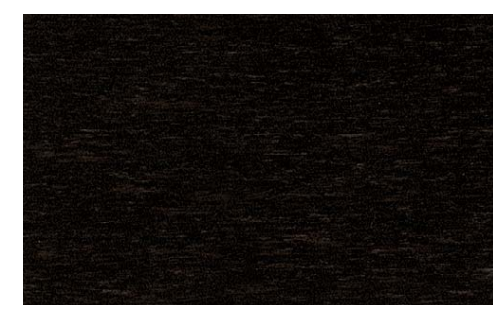
A 1.111 beech black stain