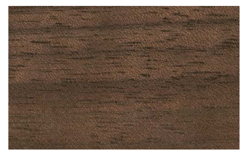
NC 8.011 solid black walnut oiled