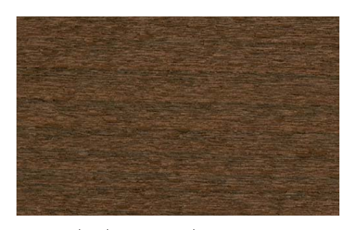
A 1.146 beech american walnut stain