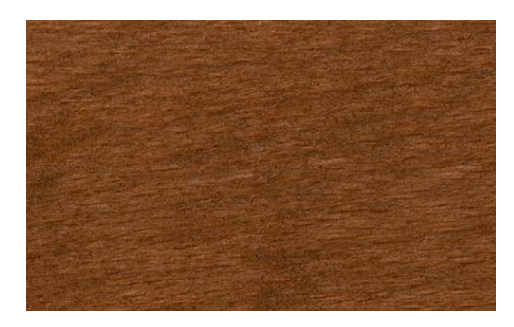
A 1.141 beech natural cherry stain