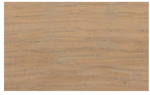
R 3.102 oak light stain