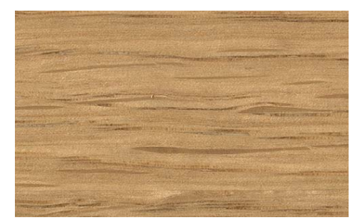
R 3.011 solid oak oiled