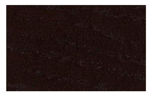
R 3.144 oak wenge dark stain