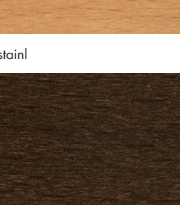
A 1.134 beech wenge stain