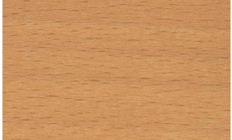
A 1.101 beech natural stainl