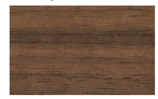
NC 8.146 black walnut stain